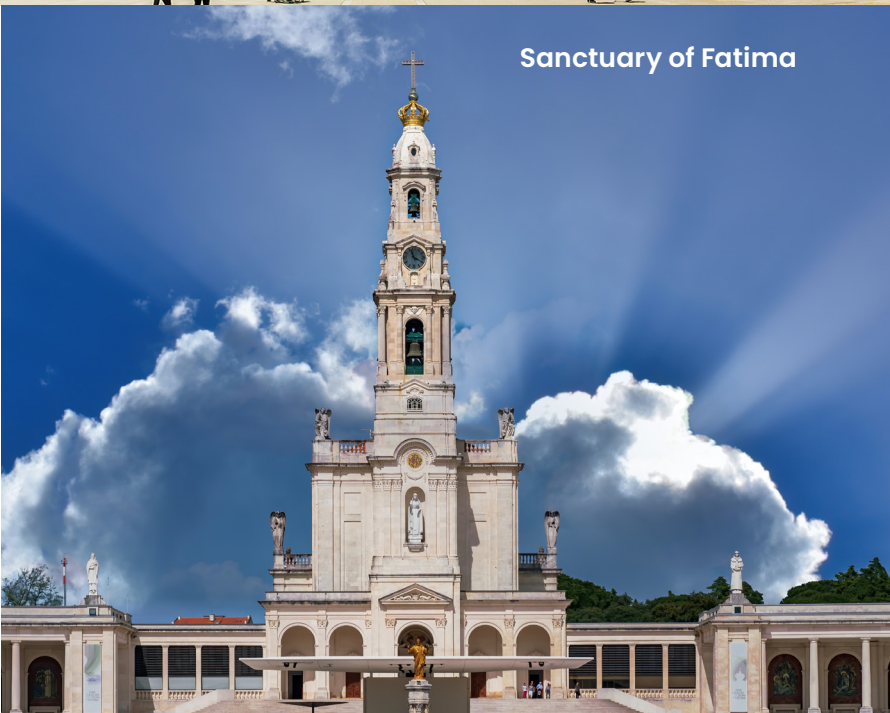
Sanctuary of Fatima